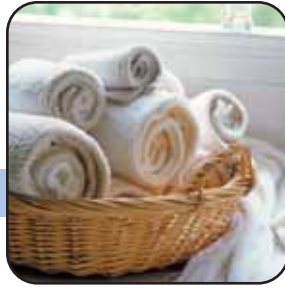
Better in the laundry.