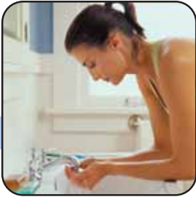
Better in the bath.