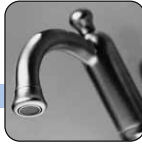
Better from the faucet.